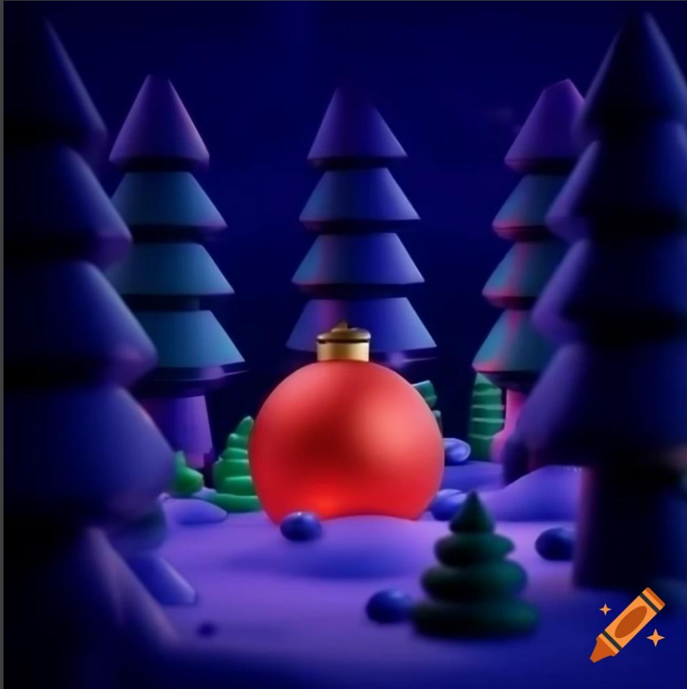
Winter Holiday Scene Using Craiyon Artificial Intelligence Software. www.craiyon.com