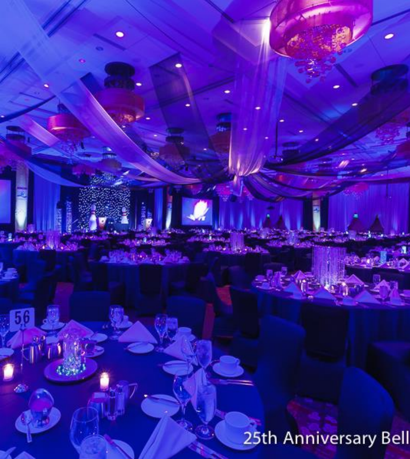
25th Anniversary Bell